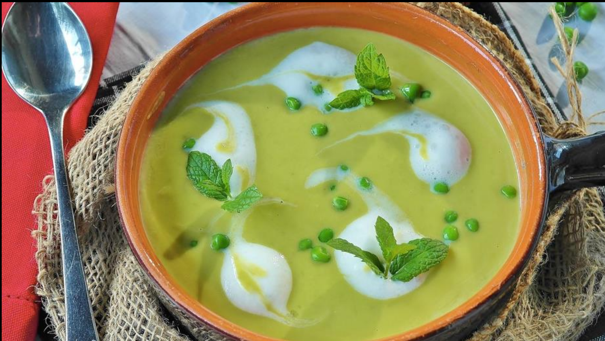
INGREDIENTS EMPOWERING SOUP